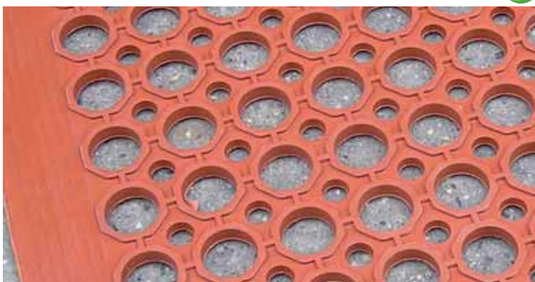
FM3660R – Oil resistant mat.

Measures 910 x 1520 x 10mm (this mat is coloured red to distinguish that it has oil resistant properties, compared against other normal mats in black).