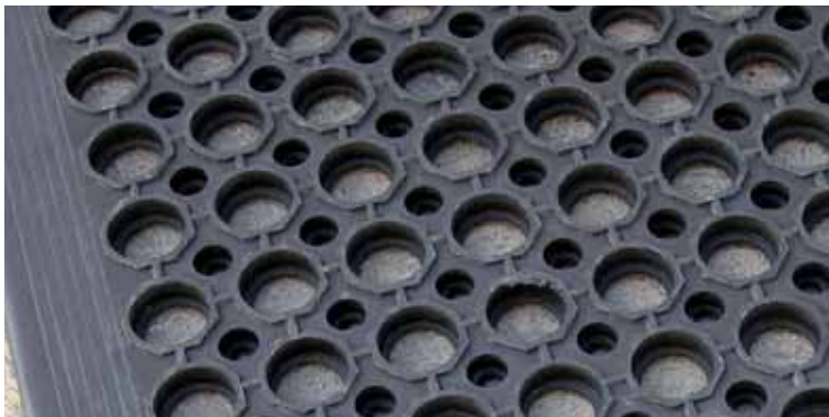
FM3660 – Anti-fatigue mat.

Manufactured from hard wearing black natural rubber. Measures 910 x 1520 x 13mm.