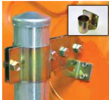
Post mount bracket & wall mount bracket (inset).