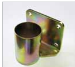
Wall mount bracket.

All of these mirrors come complete with both wall mount brackets and post mount brackets to suit a 60mm diameter post. Additional 60mm wall mount brackets are available if required.