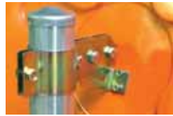
Post mount bracket.