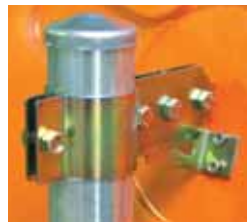
Post mount bracket.