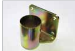
Wall mount bracket.

An extremely durable weather-proof mirror suitable for road and pedestrian traffic applications, distribution depots and parking areas. Unbreakable polycarbonate face with high visibility orange visor. All of these mirrors come complete with both wall mount brackets and post mount brackets to suit a 60mm diameter post. Additional 60mm wall mount brackets are available if required.