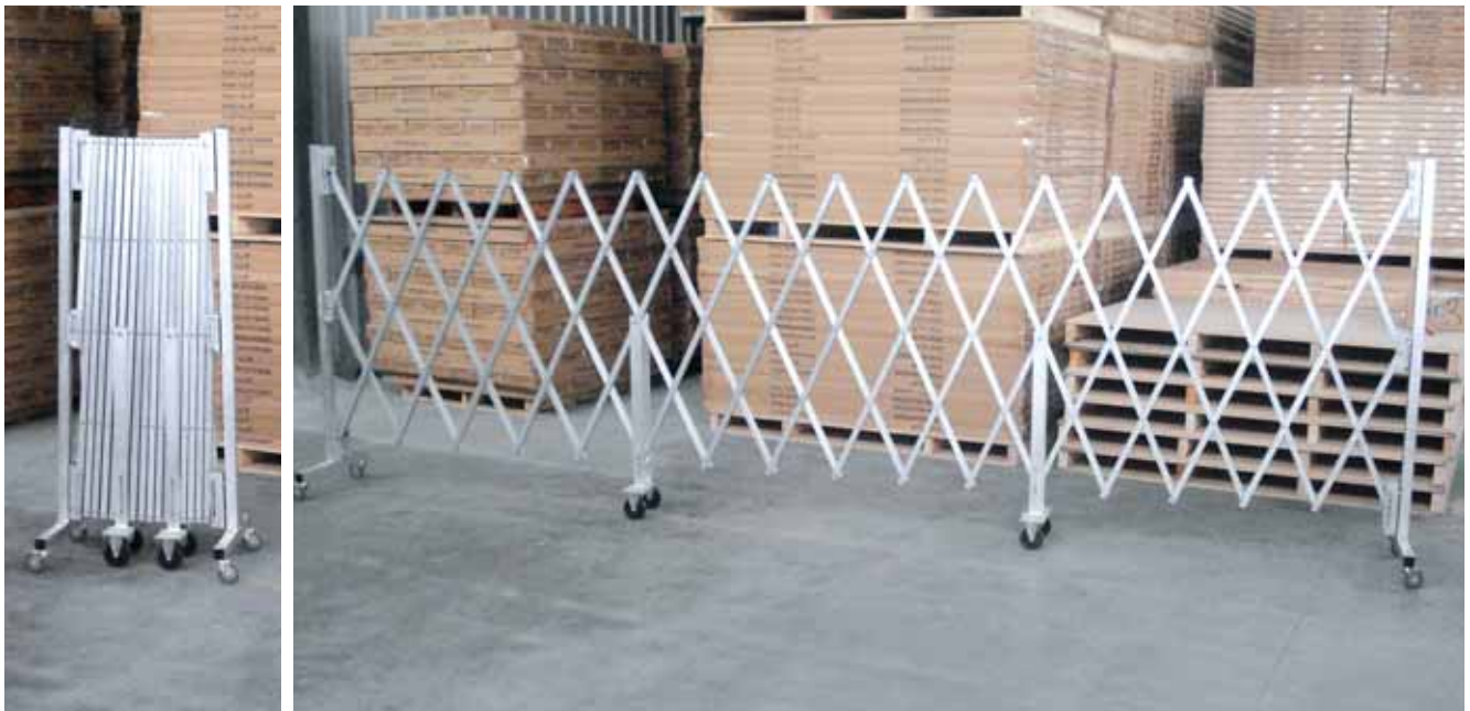
BPGM140 Port-a-guard Maxi.