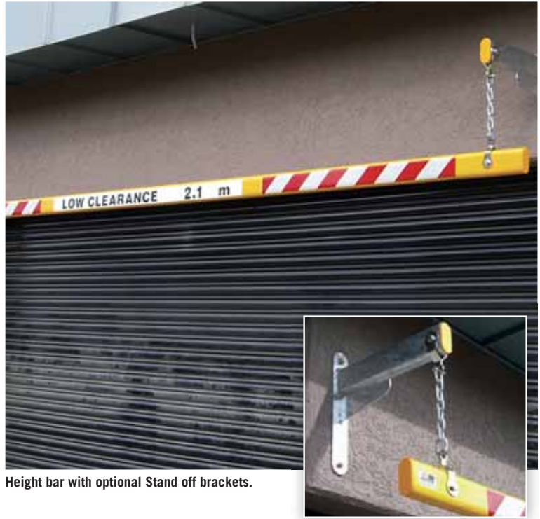
Height bar with optional Stand off brackets.