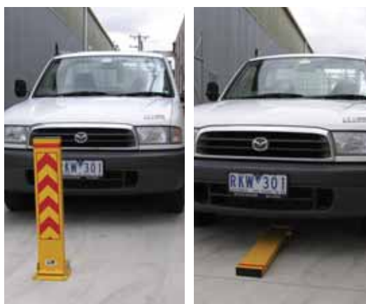
Now hot dip galvanised.