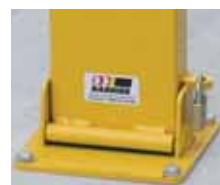
FDS150 – Padlock