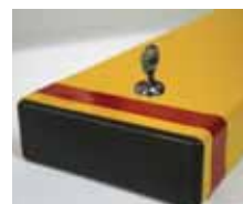
FDS150K – Key lockable