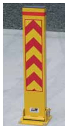
FDS1 – reflective sign face