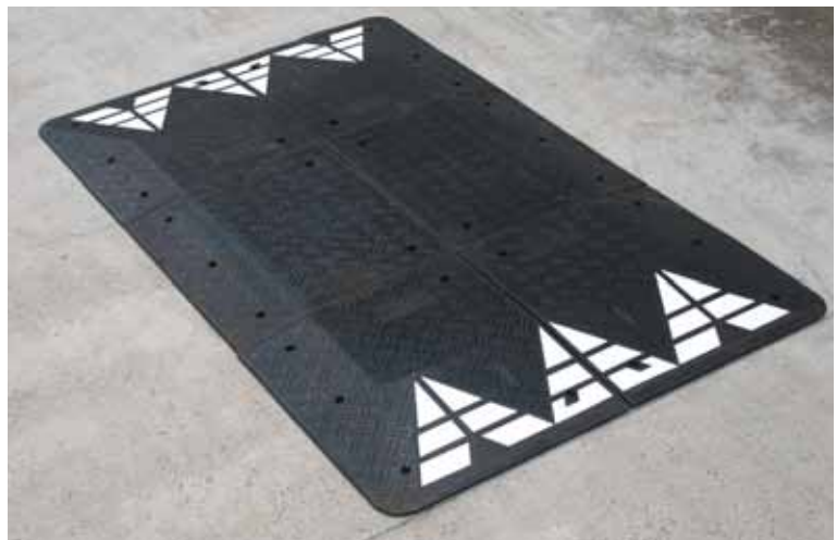
6 panel kit shown (RSC-KIT6).