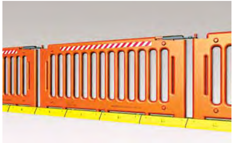
Menni-Q – strength with flexibility.