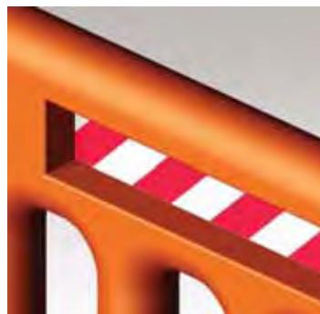
Recessed reflective panels.