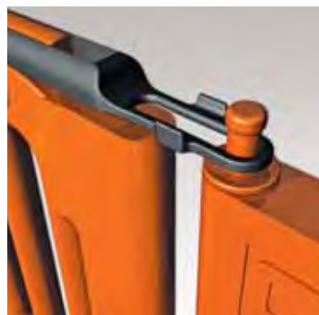
Sliding panel connector for uneven grounds.