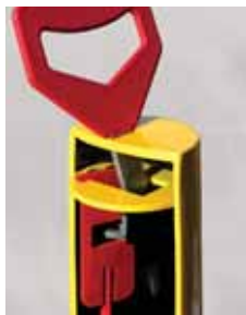
2. With key fully inserted move to upright position to engage locking rod.