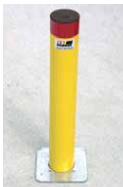
3. Turn to lock in up position.