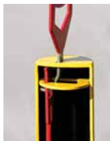
4. Lift key until it stops. Locking rod is now disengaged.