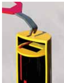
1. Insert key with teeth facing narrow side of bollard.

IMPORTANT NOTE: when lifting the bollard the internal locking rod must be engaged by the key. Failure to do so will result in the bollard not being locked when in the raised position. SEE CUT-AWAY VIEWS BELOW.