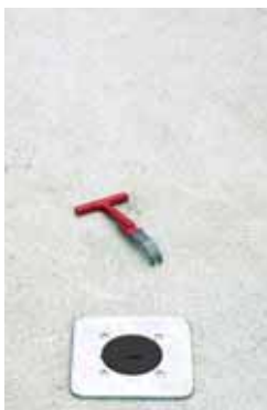
1. Locks in down position.