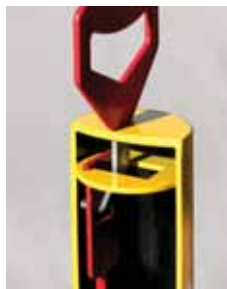
3. Key shown correctly inserted prior to lifting.