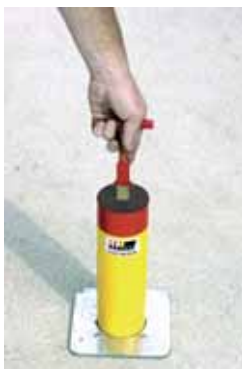
2. Turn to unlock and lift.