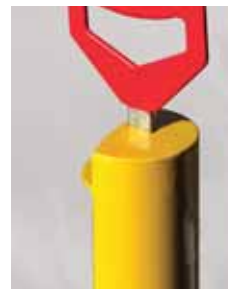
5. Rotate bollard to locked or unlocked position. Release key to re-engage locking rod. Check lock.