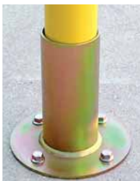
Surface mount holder.