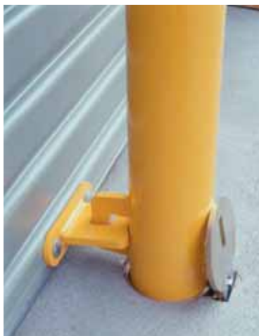
Roller door locking assembly.