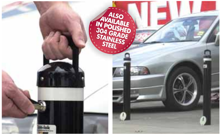
High security cam-locks with registered keys.

NOTE: ST/ST = 304 grade stainless steel.