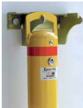
Double hanging holder.