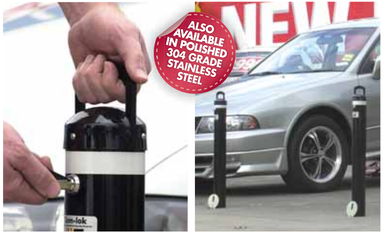
High security cam-locks with registered keys.

NOTE: ST/ST = 304 grade stainless steel.