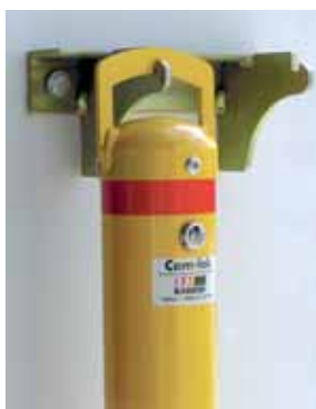
Double hanging holder.