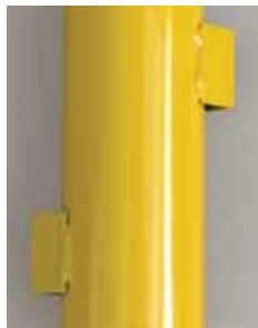
Welded anchoring bars.

Polyethylene protective sleeves are available to suit round C90 and C140 bollards. For more information see Section 1.1.