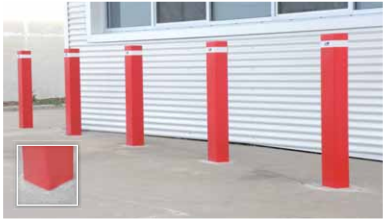
CS150BG Bollards shown.

Available in round or square designs. All our bollards are hot dip galvanised with the option of a powder coated finish.