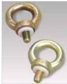
Optional chain rings (FIX1117).

Optional chain rings are available for connecting chains or ropes to our bollards. Simply order with chain rings. Chain rings can also be purchased separately for retro fitting to existing bollards by drilling and tapping M10 threads as required.