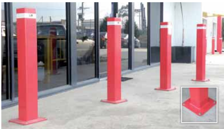
CS150SM Bollards shown.

Our fixed surface mount bollards are designed for traffic control situations or property and asset protection. Manufactured from heavy wall mild steel tube with fully welded base plates, these bollards are able to take the hard knocks. Suitable for installation onto any concrete surface. Available in round or square designs. All our bollards are supplied complete with necessary fixings and are available in a hot dip galvanised finish or hot dip galvanised with a powder coat finish.