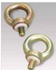
Optional chain rings (FIX1117).

Optional chain rings are available for connecting chains or ropes to our bollards. Simply order with chain rings. Chain rings can also be purchased separately for retro fitting to existing bollards by drilling and tapping M10 threads as required.