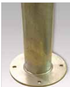
Surface mount flange.