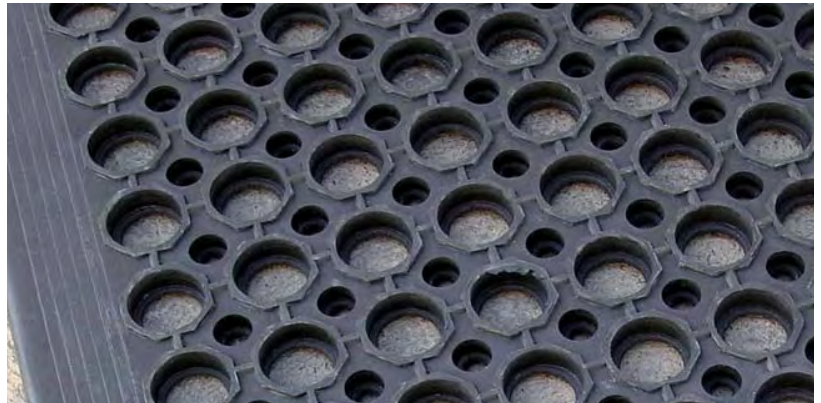
FM3660 – Anti-fatigue mat.

It is manufactured from hard wearing black natural rubber. Measures 910 x 1520 x 13mm.