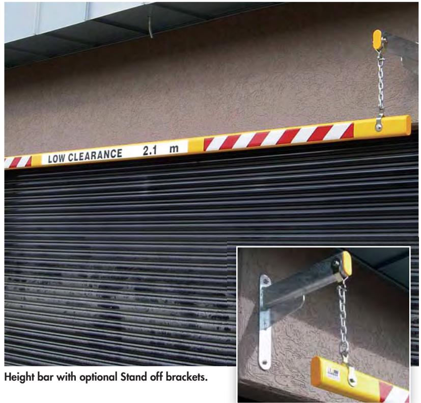
Height bar with optional Stand off brackets.

Buyers of this product should also see Section 3.3.