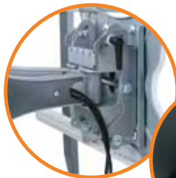
Internal Cable Management

Low profile design folds flat against wall