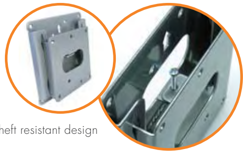
Theft resistant design