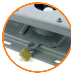
Theft Resistant Design (requires 1 padlock)