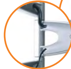
Internal Cable Management