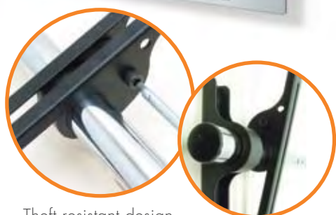
Theft resistant design