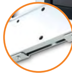
Theft resistant design