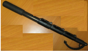
#CEM Extending Arm