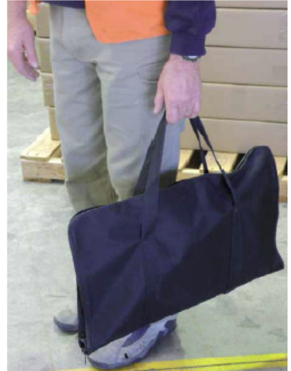
Compact carry bag