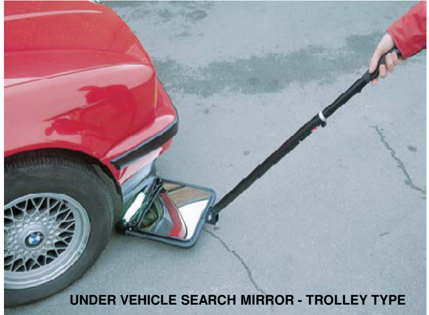
UNDER VEHICLE SEARCH MIRROR - TROLLEY TYPE

Our visual search equipment is standard issue to numerous government agencies and military units world-wide and provides users with a field-proven and versatile search capability.